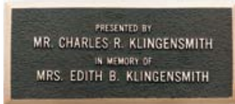
9" x 4"