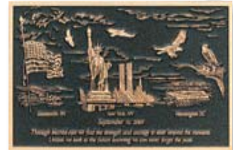
MC-9 4" x 6" Sept. 11, 2001 $216.00

Half-tone Etched Portrait 3 3/4" x 5 3/4" There is a half-tone art charge of $325.00 added to the price of the casting.