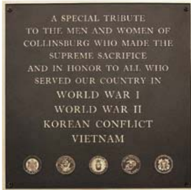
30" x 30"