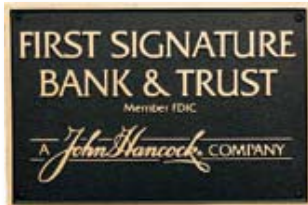
12" x 8"