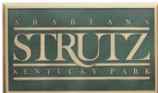
30" x 18"