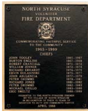
16" x 20"

Bronze tablets are cast in Sand. They can be used indoors or outdoors. Normal delivery is 5-6 weeks. Shorter delivery is possible on an overtime basis. Tablets can also be cast in Aluminum. Aluminum castings are approx. 23% cheaper than Bronze. Edges can be straight or beveled, also single line or double line border. Finishes: Raised Areas Satin Finished. High Polish requires extra pricing. Background, recessed areas, one standard color or stain. The prices in the pricelist below include a Metal surcharge of 26% for Bronze, 16% for Aluminum. Cast Bronze is 90% Copper. Significant changes to the cost of Copper may result in an increase or decrease of this surcharge. Use this pricelist as a guide line, and check with us on the price. The number of letters in the pricelist gives you the ideal number of letters per size. We do not charge for additional letters, but too many additional letters may require a larger size plaque. All plaques are furnished with mounting hardware, except for rosettes which range depending on the size of the plaque from $13.50 to $27.00 ea. Specify what hardware is required. Type A Blind Mount, type B Solid Wall, type C Hollow Wall, type D Wood Wall. Many Military, Fire Department, Civic and Religious Emblems are available and can be